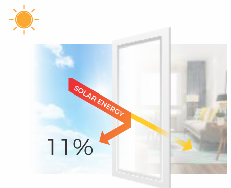
Solar Energy Rejection