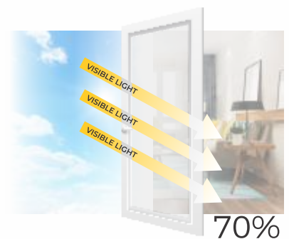
Visible Light Transmittance