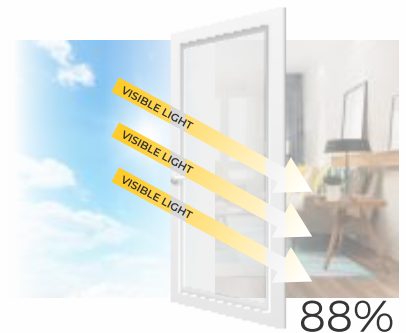
Visible Light Transmittance