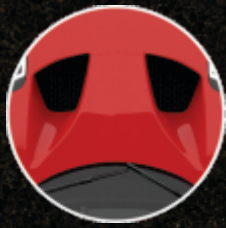
Hoods & Fenders